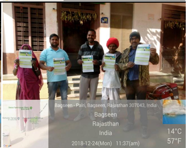
Bagseen - Palri, Bagseen, Rajasthan 307043, India Bagseen Rajasthan India 14°C 57°F 2018-12-24(Mon) 11:37(am)