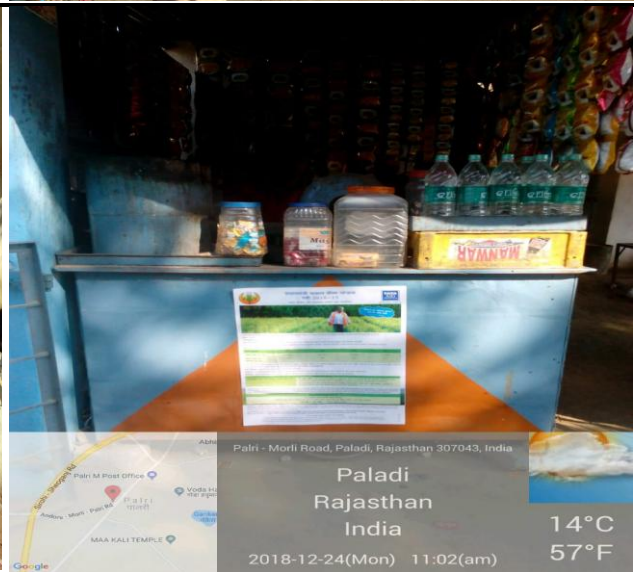
Palri - Morli Road, Paladi, Rajasthan 307043, India Paladi Rajasthan India 14°C 57°F 2018-12-24(Mon) 11:02(am)