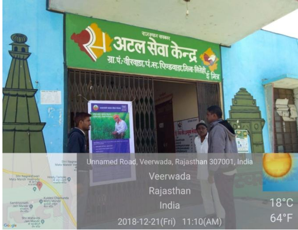
Unnamed Road, Veerwada, Rajasthan 307001, India Veerwada Rajasthan India 18°C 64°F 2018-12-21(Fri) 11:10(AM)